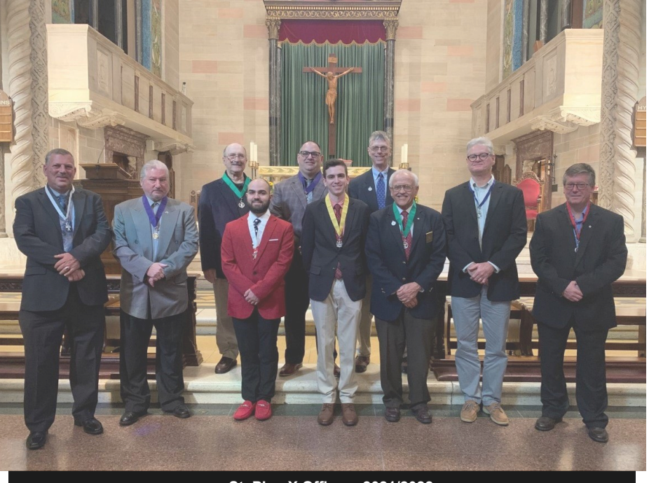
St. Pius X Officers 2021/2022